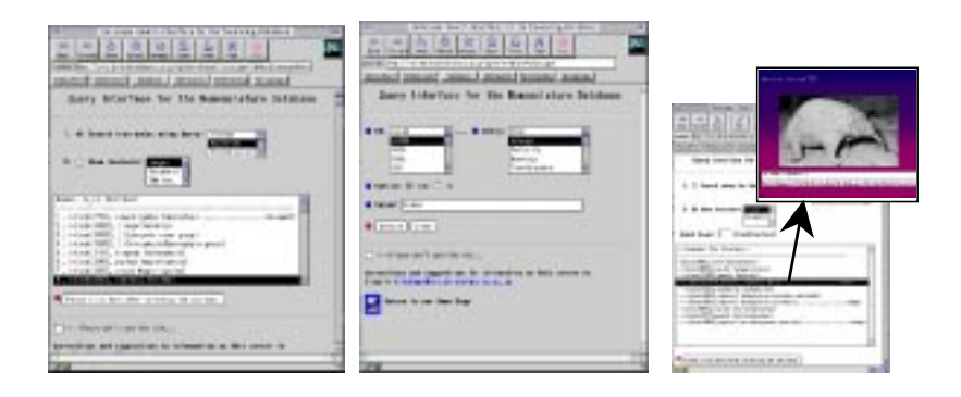
Figure 3: Window Interface to repeat the neighborhood searches.

We also developed a tool to interface between the taxonomy database system and World-Wide Web which allows remote access to the integrated database over the computer networks. The tool was implemented in CGI (Common Gateway Interface) script and the program code was about 1,000 lines in size. Figure 2 shows the system framework of the tool we developed. If users access the integrated database using Web Browser , it sends a message which includes the access method to the database server. The method represented by the stored procedure is executed on the database system after the database server has received the message. The tool has an effective window interface in which the query and result windows are the same form so that it provides users with an easy interface for use in repeatedly applying the powerful tree search methods.